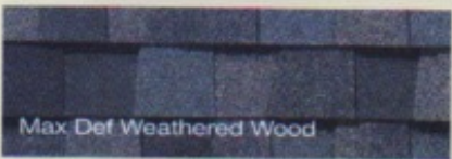
Max Def Weathered Wood