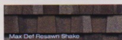
Max Def Resawn Shake