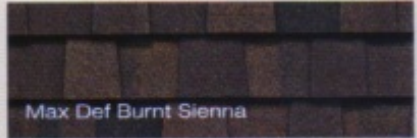
Max Def Burnt Sienna