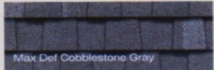
Max Def Cobblestone Gray