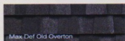
Max Def Old Overton