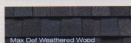
Max Def Weathered Wood