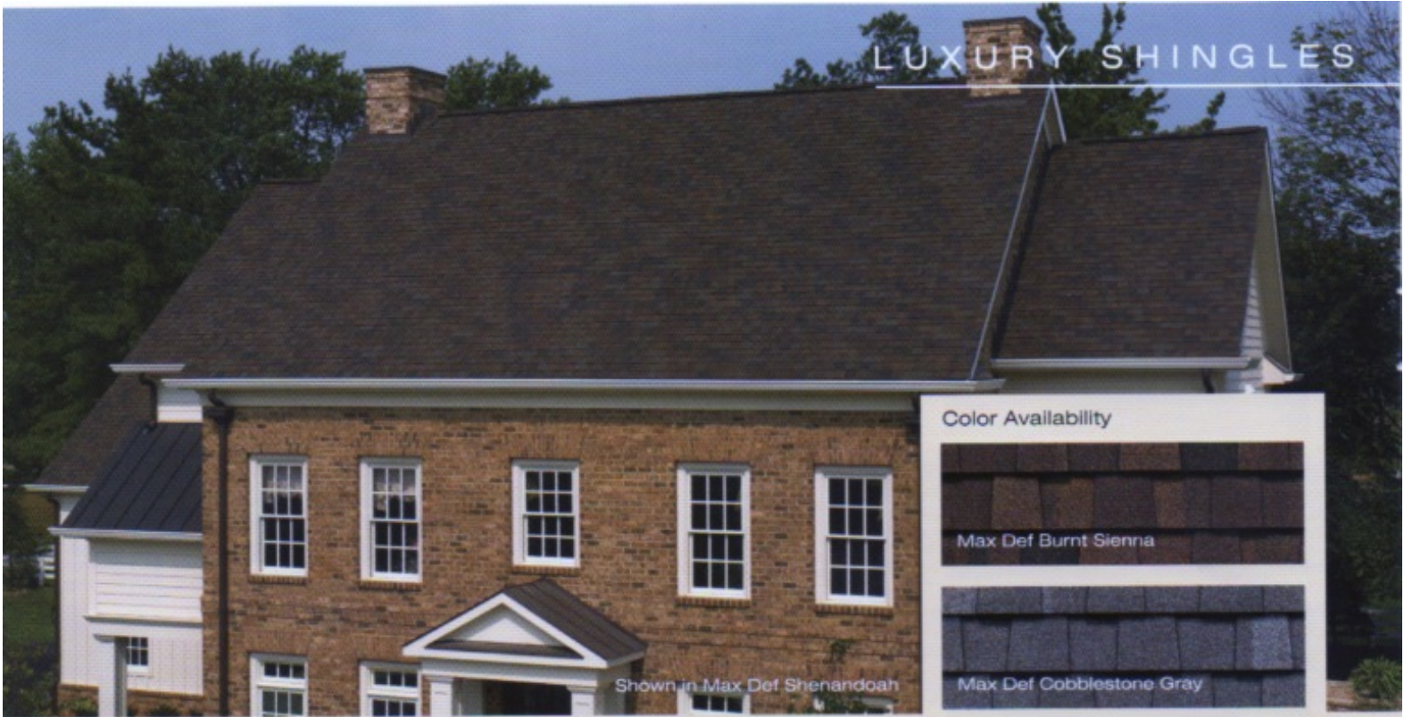
Shown in Max Def Shenandoah