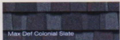
Max Def Colonial Slate