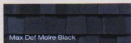
Max Def Moire Black