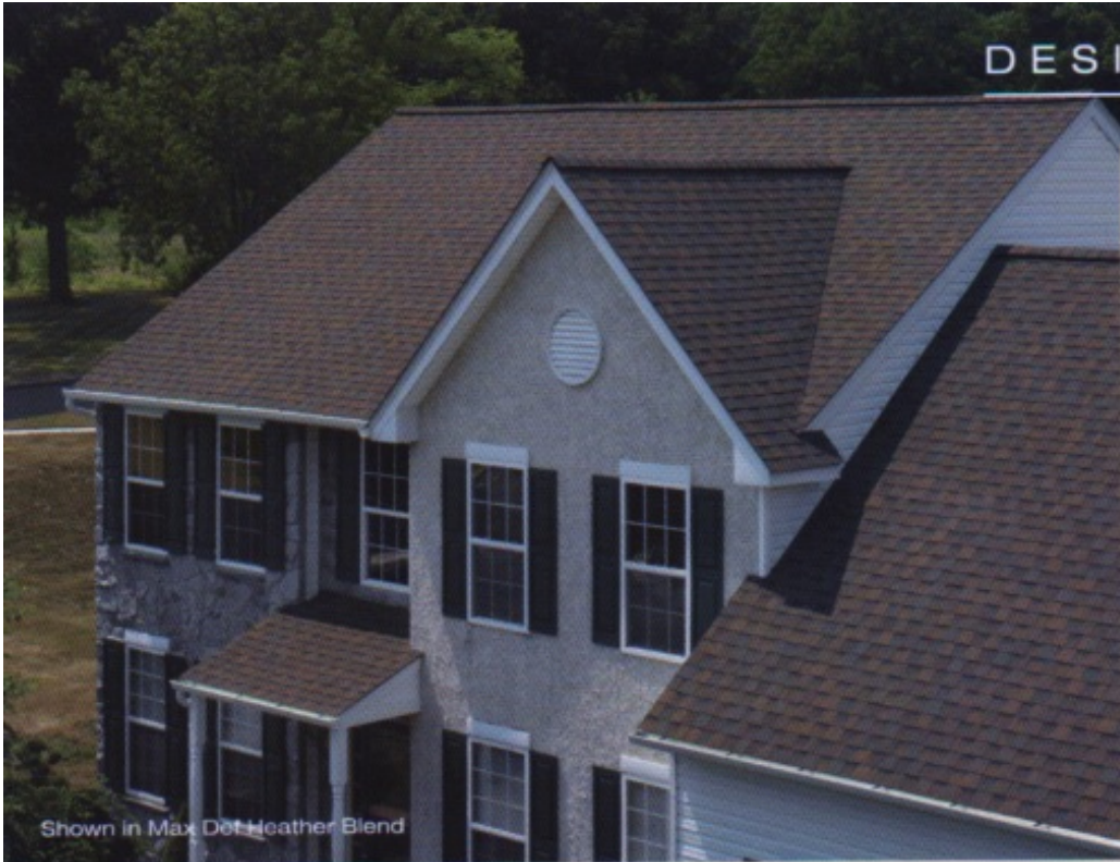
Shown in Max Def Heather Blend